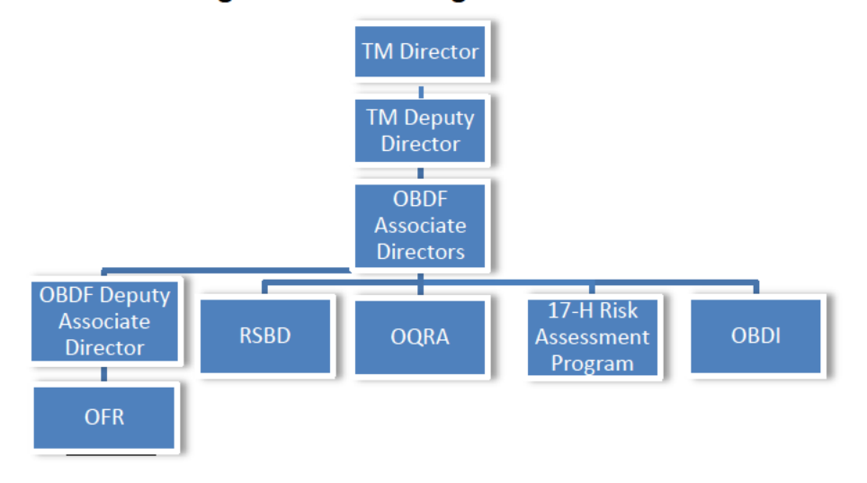
Figure 1. OBDF Organizational Chart