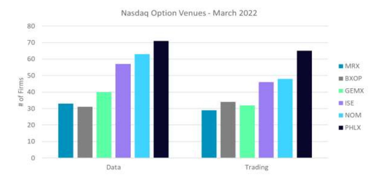
Chart 2: Number of Firms with Access to Market Data and Purchasing Trading Services from Options Venues (March 2022)

Chart 2 shows that 34 firms subscribed to at least one market data product from MRX in the first quarter of 2022. This is the second lowest number of firms purchasing market data from the Nasdaq-affiliated options exchanges.