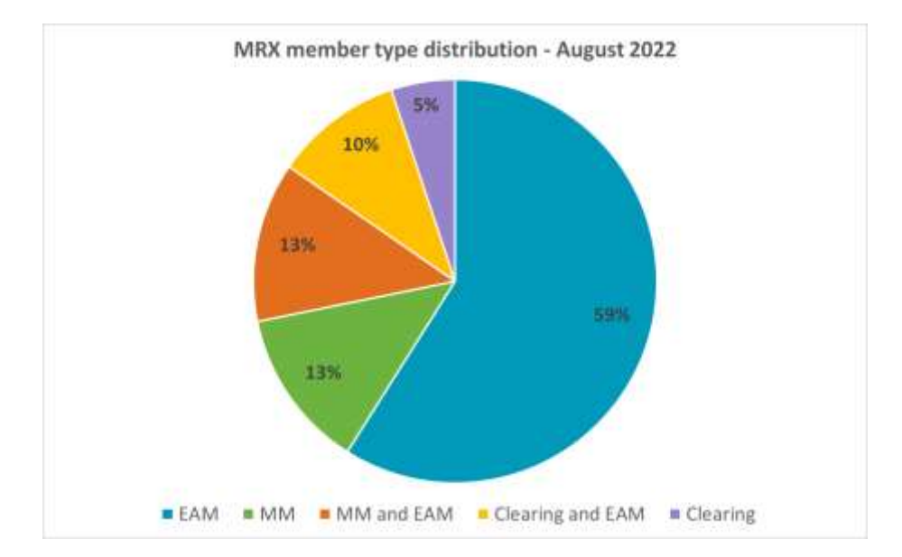
Chart 3: Composition of MRX Membership as of August 2022

The percentages in Chart 3 represent percentages of the total number of MRX Members. Some Members have dual representations (e.g. a Market Maker and Electronic Access Member) as reflected in Chart 2.