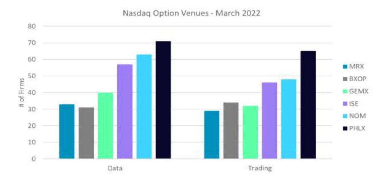
Chart 2: Number of Firms with Access to Market Data and Purchasing Trading Services from Options Venues (March 2022)

Chart 2 shows that 34 firms subscribed to at least one market data product from MRX in the first quarter of 2022. This is the second lowest number of firms purchasing market data from the Nasdaq-affiliated options exchanges.