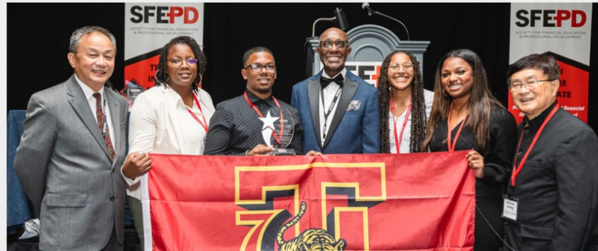
SFEPD Top Student Ambassador Program Award Tuskegee University