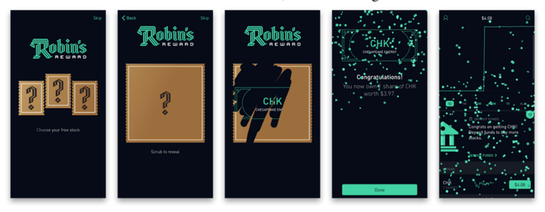
Figure 1: User flow during selection of variable reward, circa 2018

3. Eye candy. People sometimes use gamification to refer to "eye candy," or aesthetically pleasing design.<sup>48</sup> Robinhood's signature piece of eye candy was digital confetti: upon completion of a first trade, confetti would rain down the screen, as seen in Figure 1 below.<sup>49</sup> The